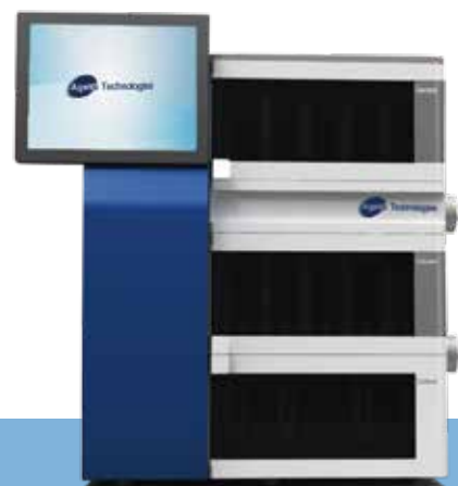
Qdaura® Automated SPE System