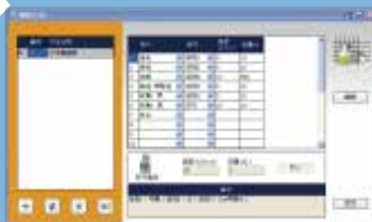
Method Editor easy and convenient