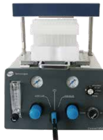
Cleanert® M96 Positive Pressure Device