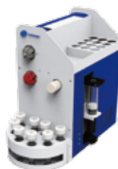
ATS Series Auto-sampler