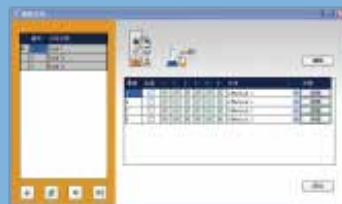
Sequence Editor clear and easy to understand