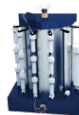
FLEXA™ Series Column Switcher