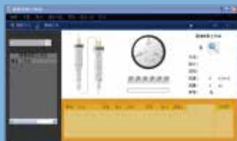
Operation interface Real-time status monitoring