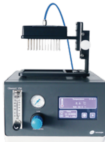
Cleanert® V96 N 2 Evaporator